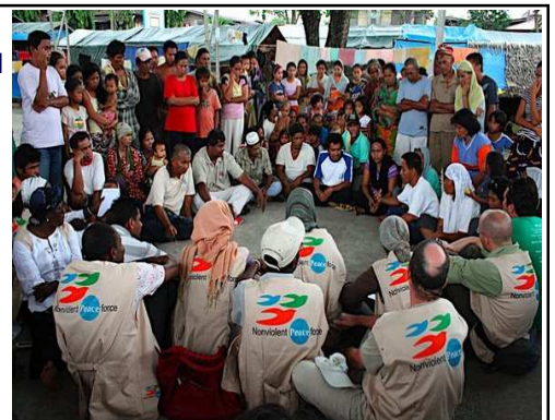
Meeting in Mindanao along with IDP camp leaders