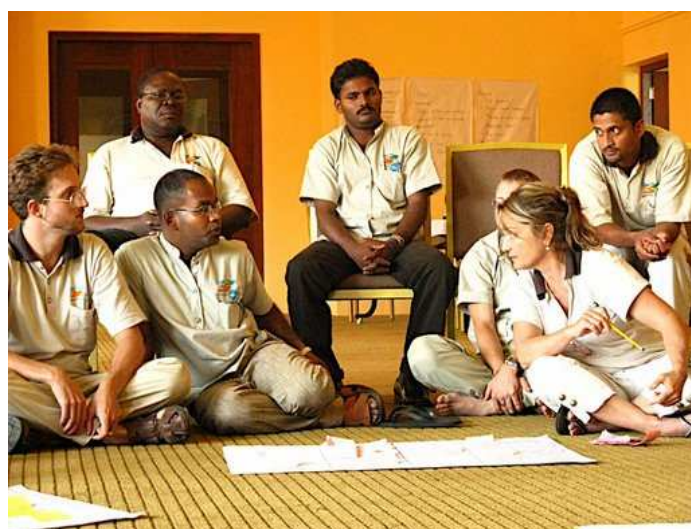
NPSL staff at a Strategy Workshop, Kalutara (South of Colombo)

Simultaneously, the Valaichchenai team continues to provide office space to the Norwegian Refugee Council (NRC) in its office annex so that people in more rural areas of the northern part of the district can access NRC services.