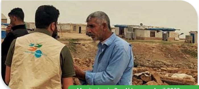
Monitoring in Rey Al Jazeera, April 2022

With your support, NP will monitor for any signs of an upcoming eviction and continue to advocate for families to remain in the camp until they are safe to leave. And we will work with the families to ensure a dignified return to their permanent home.