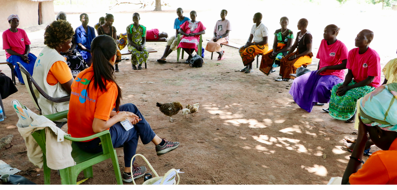
Caca facilitates a training on nonviolent communication with the local Women's Protection Team.

reduce cattle-raiding in their community, the women themselves suggested that they could talk to the mothers of the cattle keepers about ending the violence.