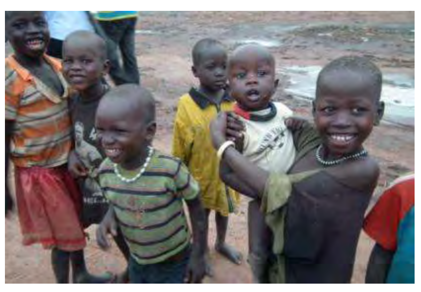
Figure 5 Children Affected by Conflict in Mopourdit

Honorable Simon Malual Deng, a member of parliament from the South Sudan Legislative