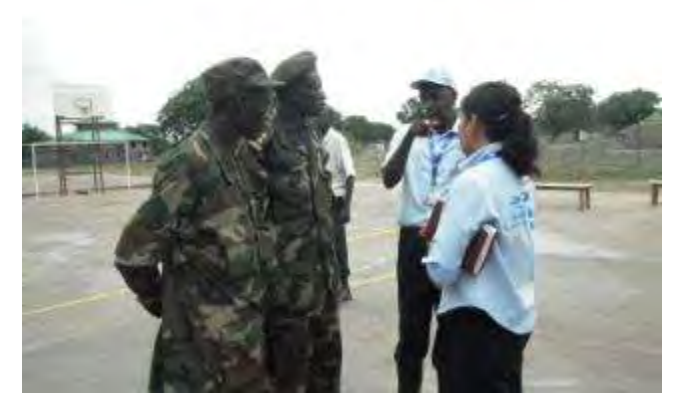
Figure 6 Working with the Military

commissioner of Yirol West had immediately sent out an investigation team to Anuol when he got word of the attacks and picked up two youth who had confessed to the attack. The boys, who were from Abang Payam, were being held in the local prison, where NP visited them. Leaders of Abang stated the incident was in isolated criminal act and by no means was a representation of the community as a whole. They, together with the administrator of Anuol also wrote letters to the communities of Mvolo to express their condolences.