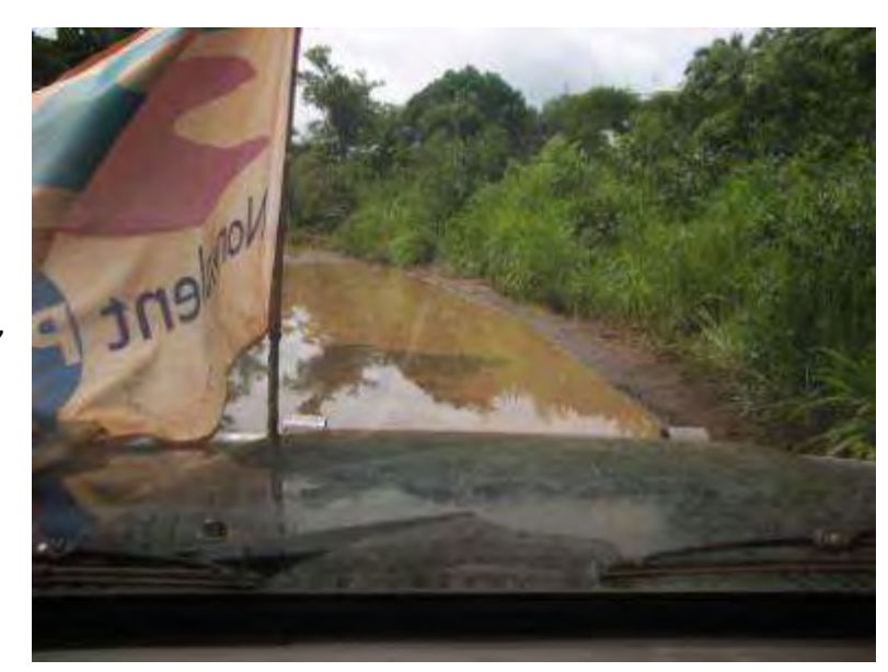
Figure 1 Traveling the roads of South Sudan

security for civilians affected by the fighting and to support the development of a sustainable peace agreement. Providing civilian protection in a conflict such as this is complex. While on the surface, the conflict presented as intercommunal it was occurring across a state border, thereby developing a significant political aspect to it. Additionally, the violence was occurring in a very remote area that was difficult to reach by road and impossible to reach by phone. The NP team designed a protection strategy that encompassed the range of actors from the grassroots communities to the national level government.