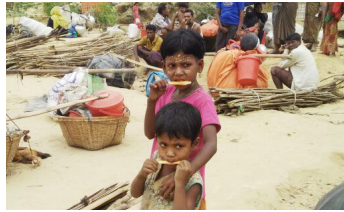
Keep communities in place