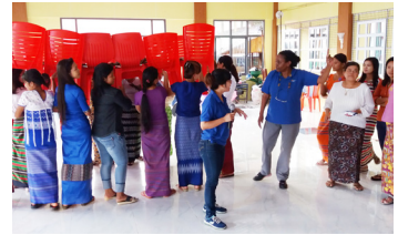
Facilitate humanitarian work