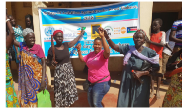
Support local communities