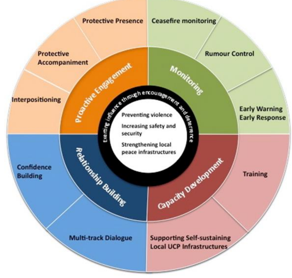
Figure II: UCP Methodology and Activities

Over the past 12 years, Nonviolent Peaceforce has developed and field-tested unarmed civilian protection techniques, which are based on four main methods: proactive engagement, monitoring, relationship building, and capacity development. Each of these methods has a number of applications as detailed in the graphic below. Frequently, UCP methods and applications are used in a dynamic interaction, reinforcing and complementing each other. Actual implementation activities are based on specific context, conflict analysis, and risk assessment.