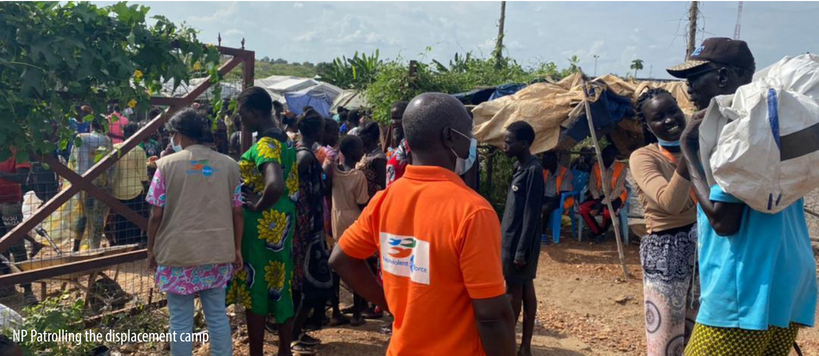
NP Patrolling the displacement camp