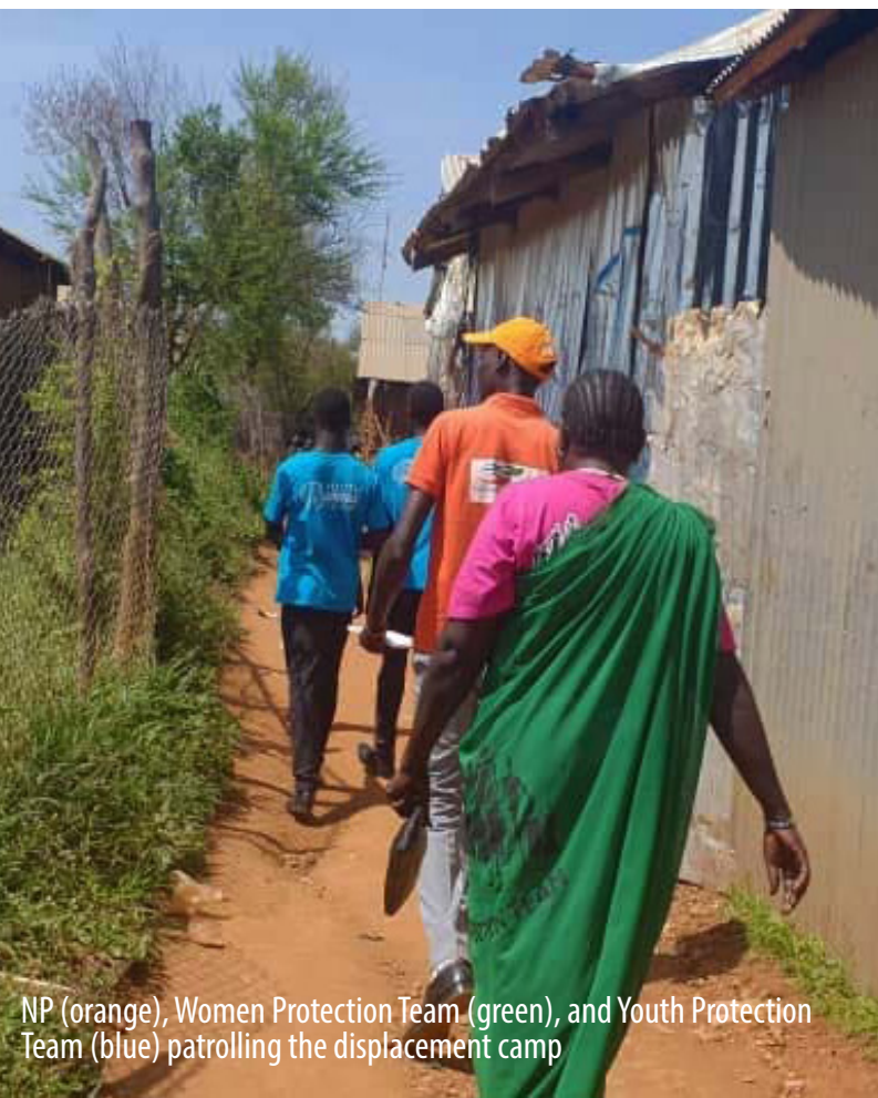
NP (orange), Women Protection Team (green), and Youth Protection Team (blue) patrolling the displacement camp