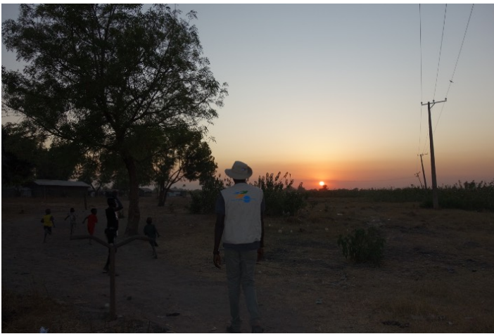
Photo: NP team on a night patrol in Bentiu town/ January 2020

Further, night patrols have strengthened NP's trust and acceptance, thereby contributing to a greater understanding of the context and of the needs of the community. Moving forward, NP will continue conducting night patrols paired with advocacy for increased action by the government and the police to ensure the safety and security of the community.