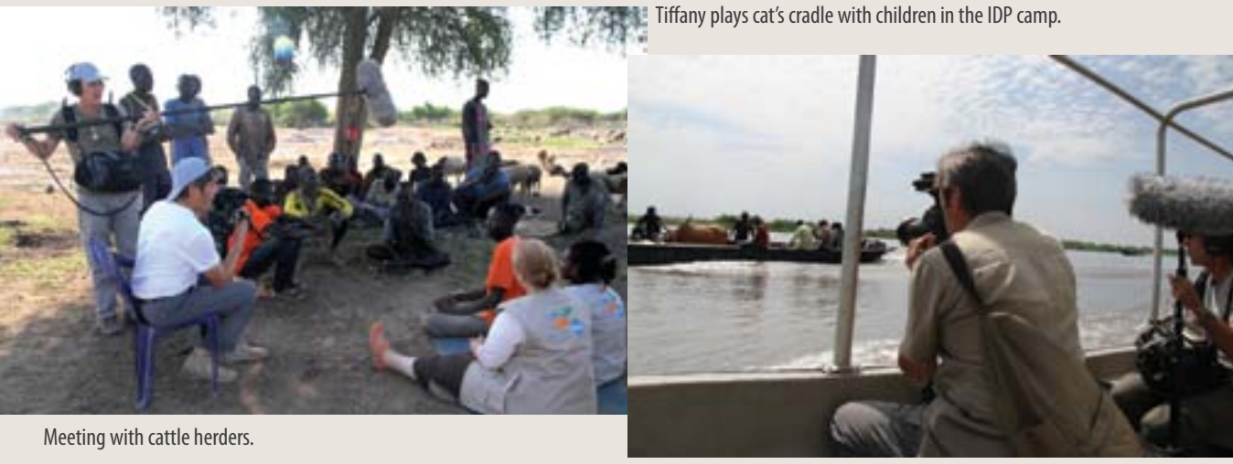
IDP returnees on the Nile—with cattle.