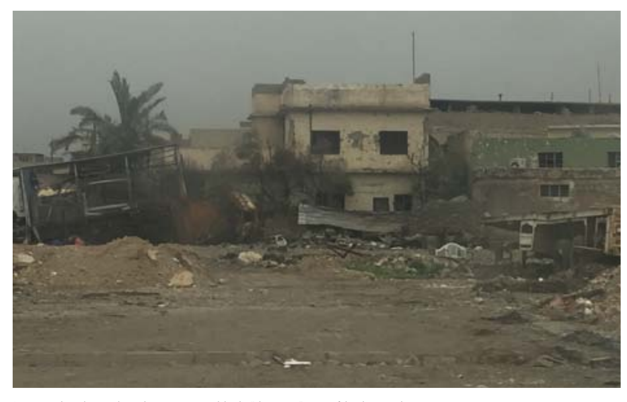
Driving northwards toward Mosul in Iraq I was struck by the "ghost town" nature of the places we drove past.

THE SUN WAS JUST COMING UP as I was sitting in the backseat of a Land Cruiser, pulling out of the calm and safety of the city of Erbil in northern Iraq. Traveling with colleagues from the UN's Office for the Coordination of Humanitarian Affairs (OCHA) we were headed to Mosul. The offensive on the western part of the city was underway. As part of a larger campaign to eliminate ISIS presence in Iraq, the Iraqi-led coalition forces were working to reclaim the city after it fell to ISIS two years ago.