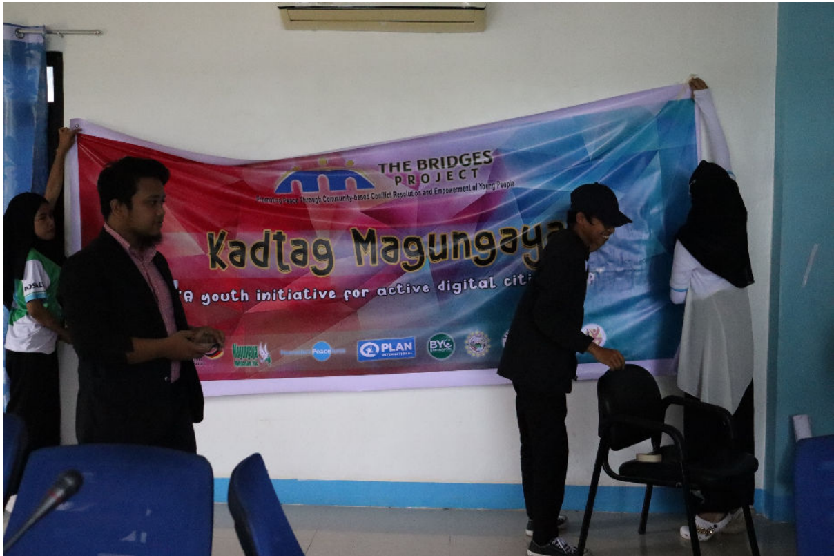
Titayan & CABCEP preparing for their workshop on Digital Citizenship

A group youth-led organisations in Maguindanao province is helping young people, parents, and guardians strengthen their capacity against online sexual exploitation of children (OSEC) and other types of cyber violence. We went behind the scenes with two youth organizations, namely Titayan: The Bridges of Youth and Council of Active Bangsamoro for Community Educational Progress (CABCEP)'s Kadttag Magungaya: A Youth Initiative of Active Digital Citizenship Workshop to capture their initiatives in responsible digital usage.