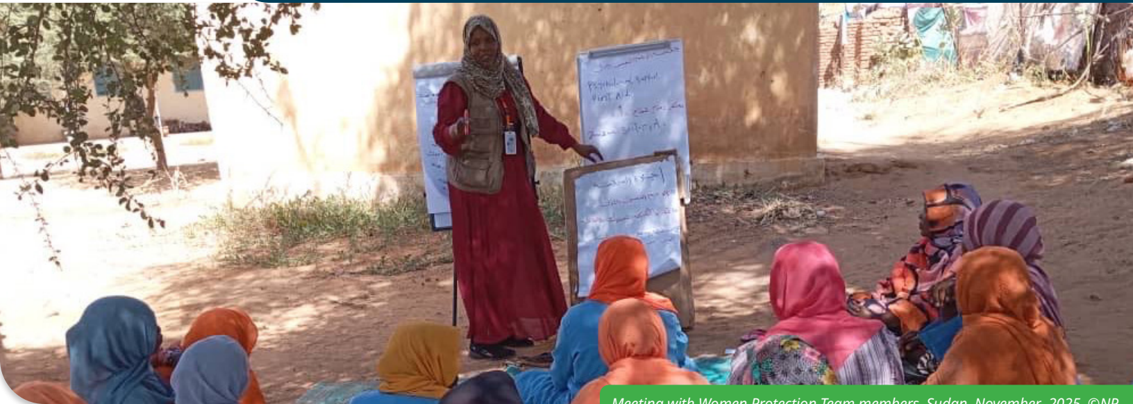
Meeting with Women Protection Team members. Sudan. November, 2025.