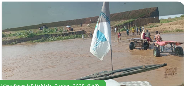
View from NP Vehicle, Sudan, 2025.

with a specific focus on caring for, and finding guardians for, separated and unaccompanied children.